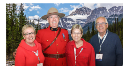
Collaborating Across Borders VI Exploring New Heights Banff, Alberta, Canada • October 1 - 4, 2017

See more photos from the conference at cabvi.banff.org .